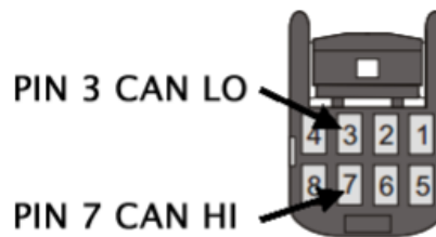
CAN CONNECTOR ON REAR OF ECU

Follow Haltech instructions to determine if you need a terminating resistor at the ECU.