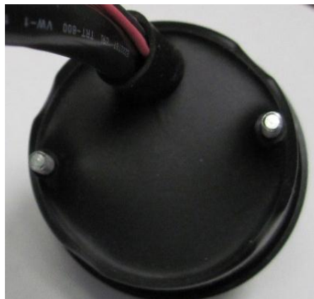
Figure 2. Installed Boot