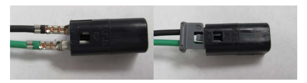
Figure 1. Insert Terminals and Lock